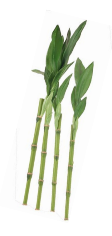
Bamboo is a natural fiber. Variations in color may occur within each plank and from plank to plank.

All trims and moldings are available in matching tones and grains